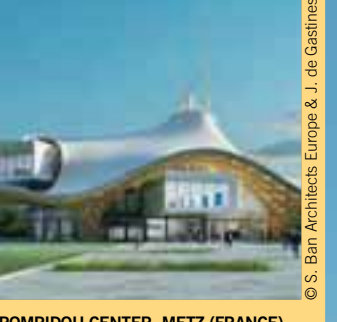
POMPIDOU CENTER, METZ (FRANCE) Due to open in early 2010.